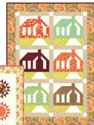
FT 1204 / FT 1204G Mini Homestead A Size: 51" x 60" (additional color way available)