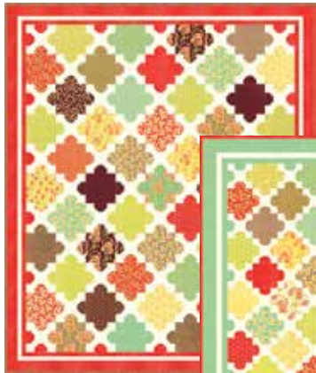
Hazel & Blooms Size: 73" x 87"