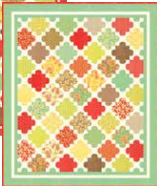
FT 1201 / FT 1201G Hazel & Blooms Size: 51" x 60"