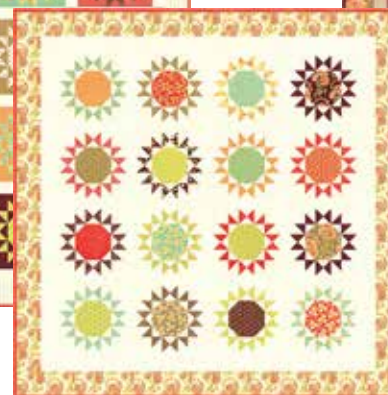
FT 1203 / FT 1203G Nutmeg Stars II #1 Size: 63" x 63"