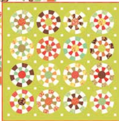
FT 1202 / FT 1202G Bottlecaps A Size: 75" x 75"