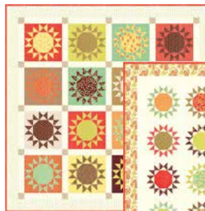
Nutmeg Stars II #2 Size: 75" x 75"

Capturing the essence and colors of Autumn in our classic Fig Tree style, this collection mixes a few of our all-time favorite fall-flavored prints with updated colors and fresh prints. Inspired by harvest time in the wine country, pumpkin patches, pomegranates and apple picking at dusk... I can just smell the scents of Autumn when I play with these fabrics!