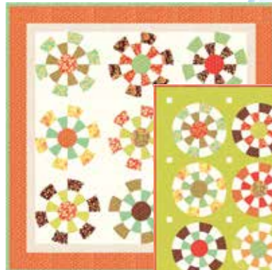
Bottlecaps B Size: 61" x 61"