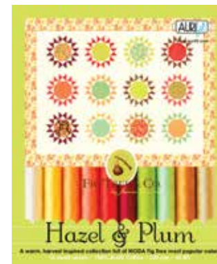
JF50HP10 10 Spools 220 yds · 50WT