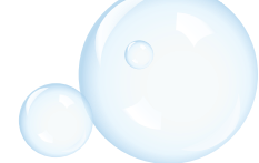
FIG TREE & CO