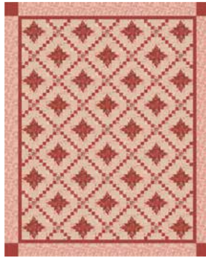
FG AF001 / FG AF001G La Vie en Rose Size: 75" x 93"