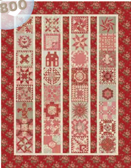
FG AF003 / FG AF003G Celebration Sampler Size: 61" x 78"