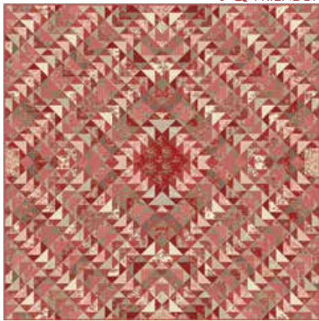
FG AF002 / FG AF002G Joie de Vivre Size: 78" x 78"