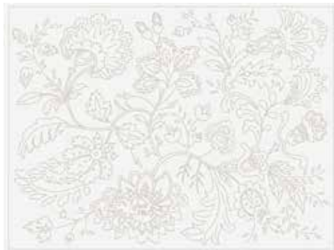
FG AF004 / FG AF004G Embroidery Sampler Size: 14" x 11"